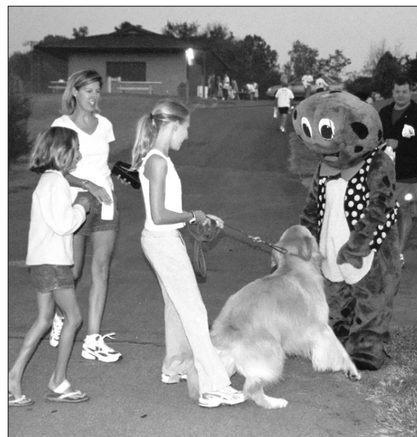
Runners, pets, volunteers, and frog...that's the WIVK Frog, gather just before Annual 5K Run / Walk in 2005. Guess the dog and frog are wishing each other good luck. Wonder who won? Both look determined!

Thanks too, to the many additional volunteers that will be there to help in different capacities on the day of the race! Don't miss the excitement! Call the Chamber office at 675-7057 or visit us on line at www.farragut.com for more information or to register.