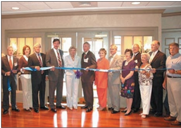
Above Left: Jefferson Federal local and corporate officials were present for the July 11th grand-opening and ribbon-cutting of the first Jefferson Federal in Knox County. Joining them to celebrate were officials of The Town of Farragut and Knox County and many friends and family.