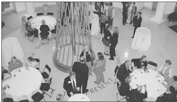
Above: November 9th the Women's Basketball Hall of Fame and Knoxville Tourism and Sports Corp. held an evening networking. A tour of the hall and a video presentation about women's basketball history helped to make the night. Chamber members gathered for food, fun and networking.