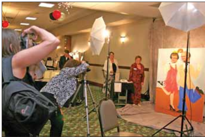
Broyles Renderings was on hand to provide fun mementos of the evening in the way of portraits taken at the cut-outs created by Farragut Middle School Students.