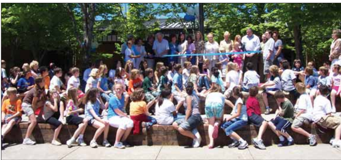
On May 8, 2007 the Farragut Middle and Intermediate Schools joined for the opening of their Outdoor Learning Center. A crowd was on hand to celebrate with a ribbon cutting. Congratulations to the faculty and students of both schools for their exciting new addition.