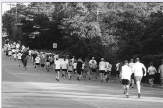
The Farragut Fall 5K runners make the initial trek up Watt Road before entering Sedgfield subdivision at the race Saturday, September 22.