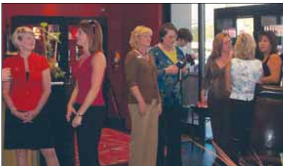
Farragut West Knox Chamber members who gathered for the ribbon cutting ceremony at Salon Biyoshi Tuesday, September 19, took tours through the salon and enjoyed some breakfast treats.