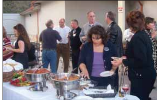
Members of the Farragut West Knox Chamber of Commerce gather on the patio of Mulligan's for an after-hours networking hosted by Nicely Business Services Thursday, November 1.