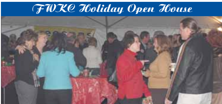
Farragut West Knox Chamber members and guests filled the party tent and enjoyed the Holiday Open House.