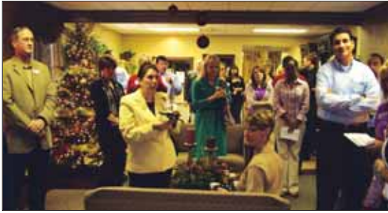
Members of the Farragut West Knox Chamber of Commerce gather for the final networking of the year Thursday, December 13 at Dermatologists Associates of Knoxville/Skin Care Center in the Farragut Medical center on Grigsby Chapel Road.