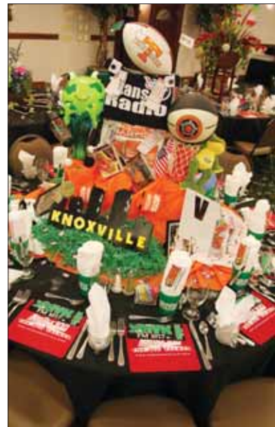
One of the award-winning tables was sponsored by Citadel Broadcasting. The table-top, which was auctioned during the live auction section of the dinner, included items such as autographed CDs, Dollywood tickets and University of Tennessee paraphernalia.