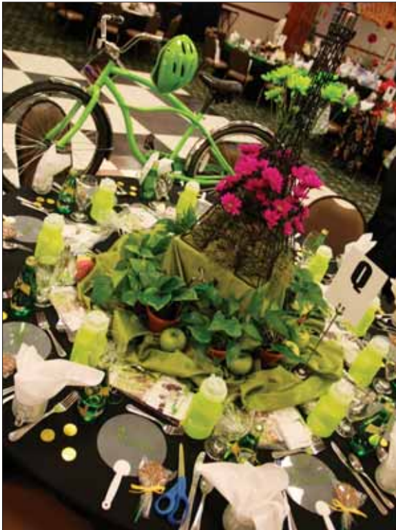
Regions Bank also sponsored a table for the auction and followed in a Tour de France theme, including a bicycle, in their traditional lime green color scheme. (Above photo)