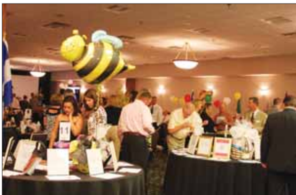
Chamber members and guests mingle as they view the many and varied silent auction items. (Right photo)