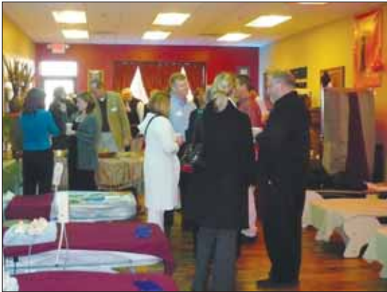
Farragut West Knox Chamber members gather at Migun – TN in the Village Green Shopping Center for the first networking of the New Year, Thursday January 8.