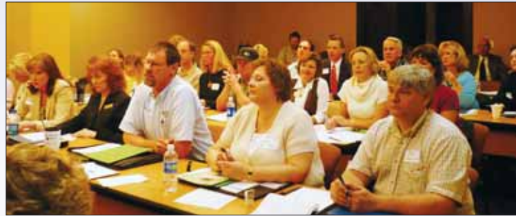
Members of the Farragut West Knox Chamber of Commerce gather at SunTrust Financial Center for Grassroots Marketing Seminar.

The Chamber would like to thank SunTrust Financial Center for providing the meeting room for this seminar. For more information about the TSBD, call the Chamber office at 675-7057.