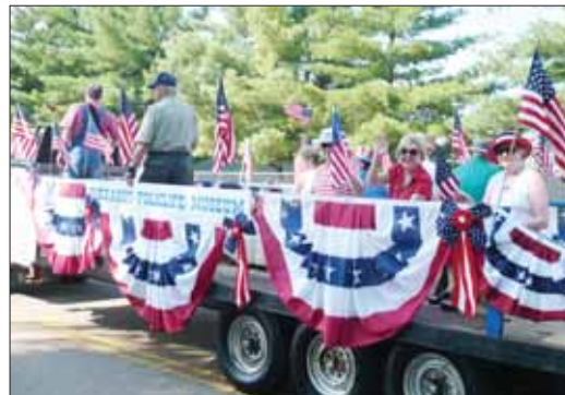
The friendly staff from the Farragut Folklife Museum get ready to hit the parade route on their very patriotic float.