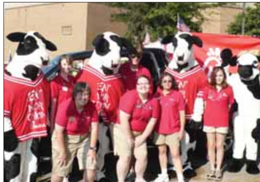
The Chick-fil-A cows pose for a picture with associates and friends from the restaurant.